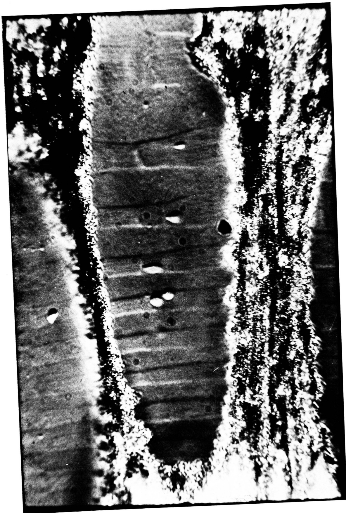
Plate 1 b.