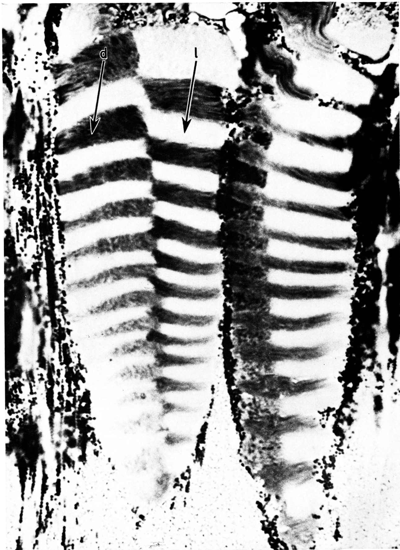
Plate 1 a.